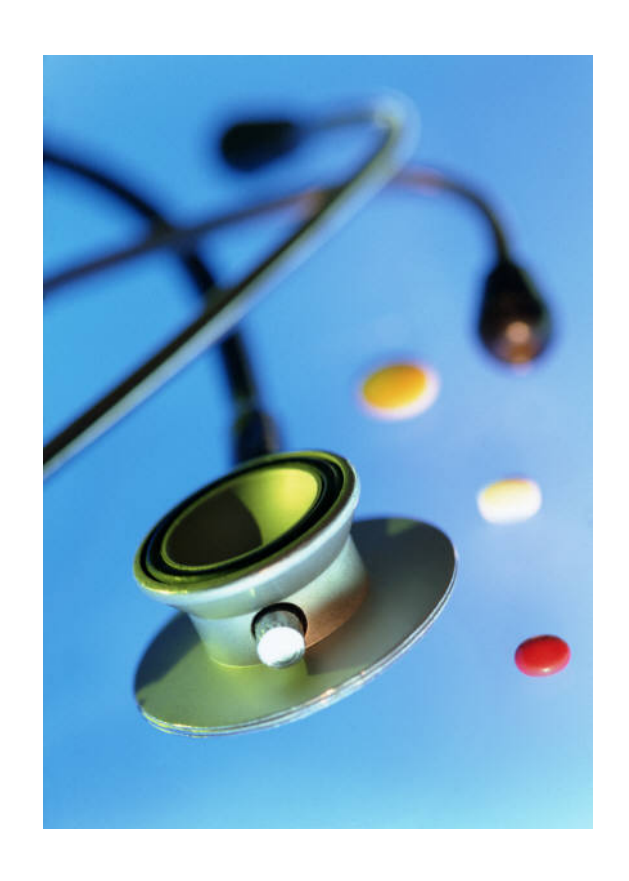
Associate Degree Nursing Student Handbook